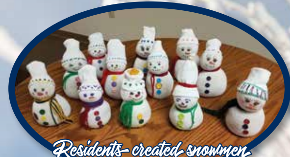
Residents- created snowmen during a recent craft session.